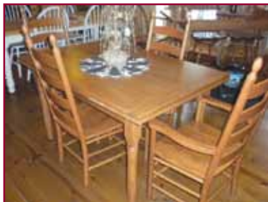
Oak Draw Leaf Table with Ladder Back Chairs