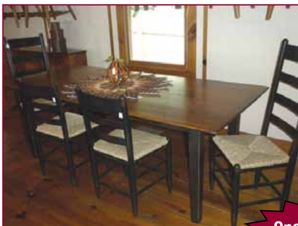
Shaker Harvest Table