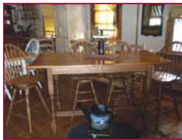
Maple Tavern Table with Windsor Stools