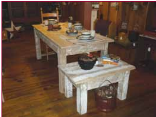
Reclaimed Oak Barnwood Tables