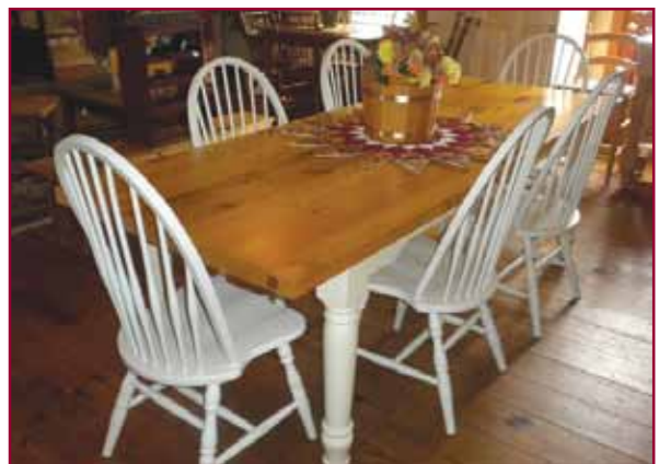
8 ft. Harvest Table with Two Inch Thick Top