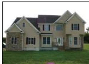
Easton - BEAUTIFUL 2800 sq. ft. custom home, 4 BR w/den, 2 1/2 baths, convenient location, many upgrades. Owner financing possible.