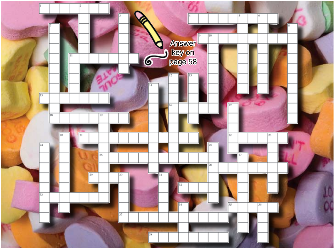
Puzzle by Carol Kinsley; puzzle program by eclipsecrossword.com