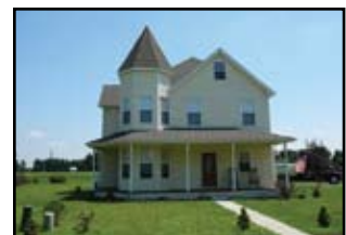
Betterton - 3 BR, 2 1/2 BA w/ bonus room and full ICF basement within walking distance to beach.