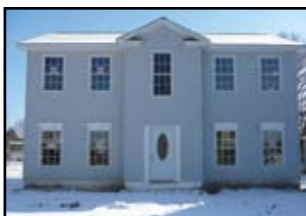
Cordova - 3 BR, 2 1/2 BA, ICF construction in desired Chapel School District. Owner financing possible.

DENTON House/Lot packages available in new Magnolia Hills Subdivision starting $400's.