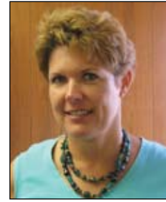
By Michele Roark Columnist

For the card or hobby table, an overhead hanging light provides excellent lighting. You may not have wiring in the ceiling nor wish to loop the chain up and over from a wall outlet, so the alternative would be a floor lamp that features a swinging arm to pull over the table top.