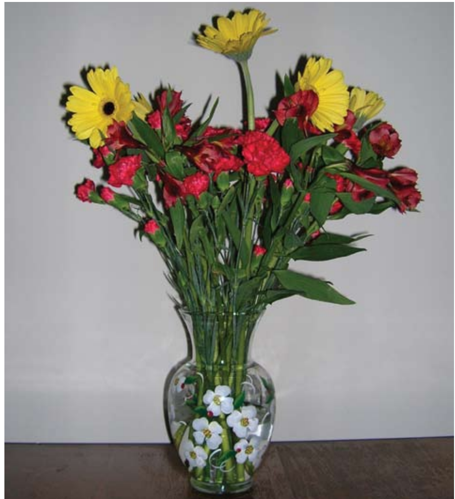
There have been studies documenting the positive attitudes of people in rooms where live flowers are displayed.