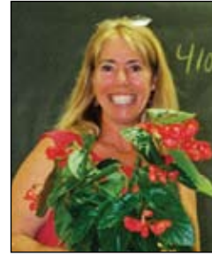
By Ginny Rosenkranz Extension Educator Commercial Horticulture

The month of February can be dark and gloomy, cold and dreary, so it is nice that it only lasts 29 days.