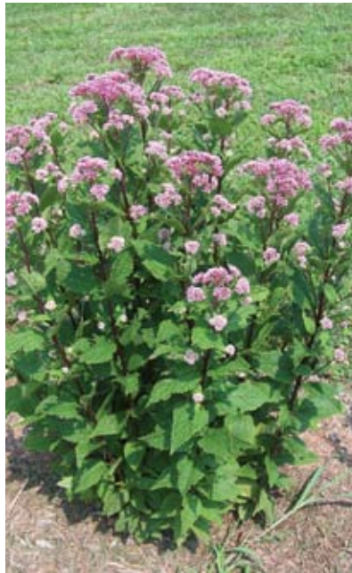
"Little Joe" adapts quickly to various landscape situations.

Another new, drought-tolerant plant loved by butterflies is a woody, Caryopteris x clandonensis "Grand Bleu," perfect for mass planting in