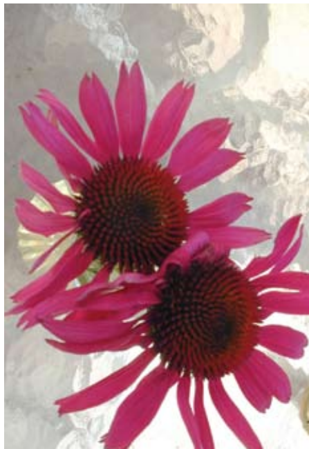
'Purple Fantasy' has more intense color with the onset of colder temperatures.

So throw away the sprayer and enjoy these easy-to-maintain roses: Fragrant Spreader Rosa x "Chewground," a low-growing rose with fragrant, single, pink flowers; Peachy Cream Rosa x "Horcoherent," a lovely low-mounded rose that delivers clouds of blooms that emerge peach and transform to cream, contrasting