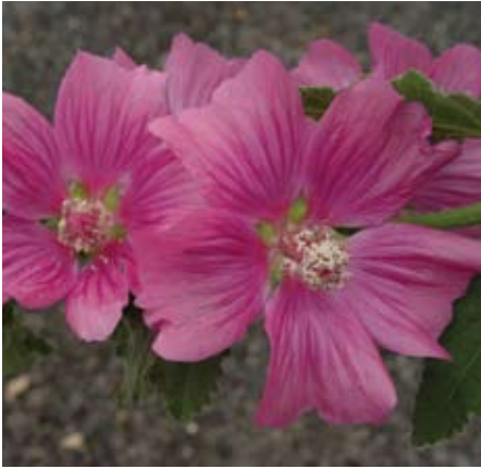
The deep pink, non-fading blooms of “Chamallow” are held on upright branches.