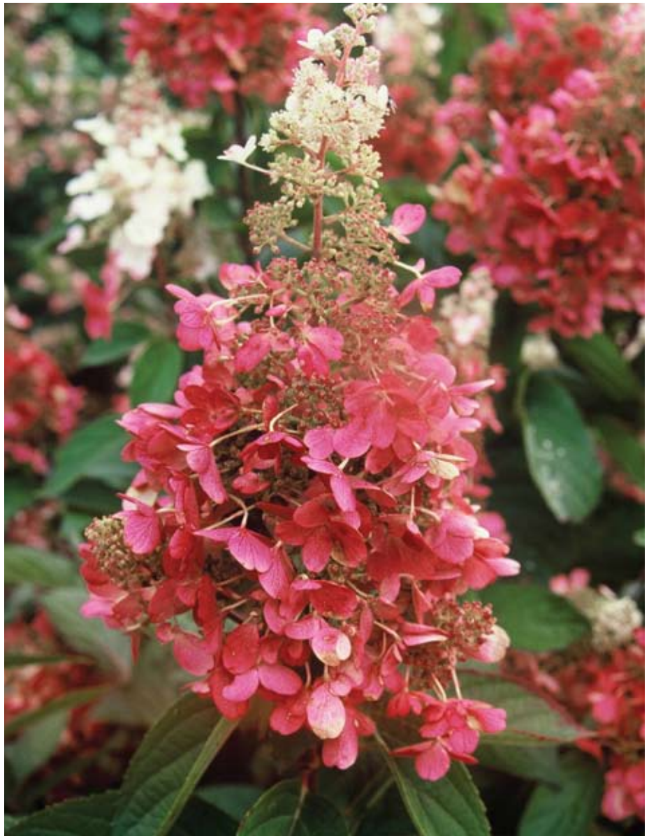
Named for a children’s television character, Hydrangea paniculata “Pinky Winky” will be a favorite with adults. The unique, bicolor blooms and strong upright stems of this Proven Winner will look great in the garden or as cut flowers in a vase.