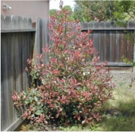
“Pink Marble” will grow in sun or partial shade and keeps its leaves year round.