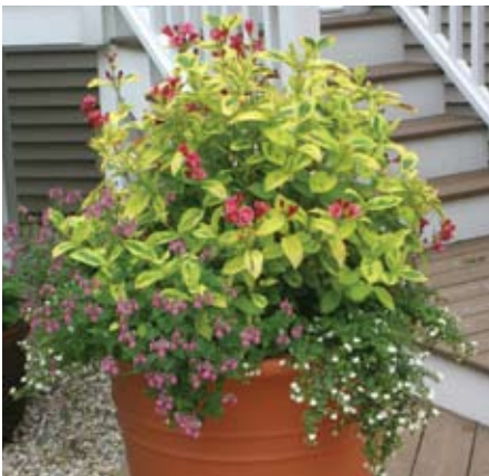
“Eyecatcher” adds season-long color to any garden, container or landscape.