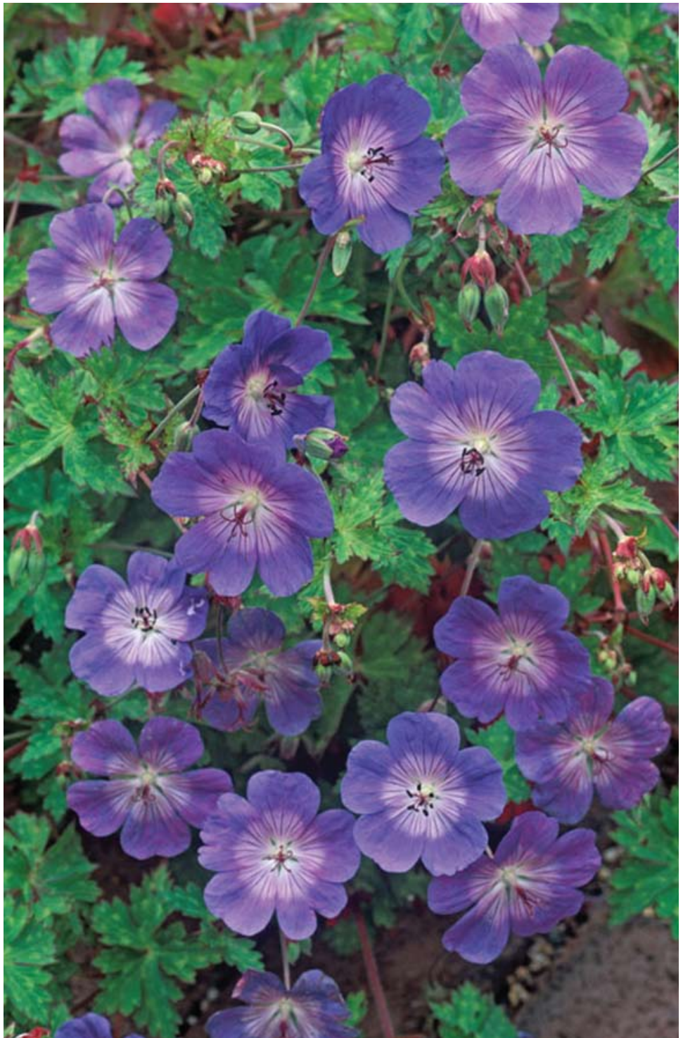
Up close or at a distance, Geranium "Rozanne" flowers stand out.