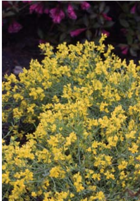
Bangle Genista produces waves of electric yellow flowers in early spring.

also boasts dark red flowers in the spring.