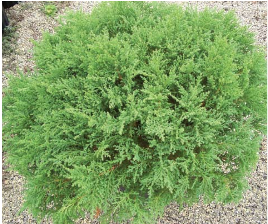
“Fuzzball” is a new fuzzy-textured form of Microbiota or Russian Arborvitae, discovered on the growing grounds at Conard-Pyle.