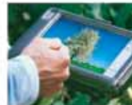
ELM, Environmental Landscape Manager.

The ELM is one of many Bartlett innovations and techniques in arboriculture that has helped Bartlett improve the landscape of tree care since 1907.