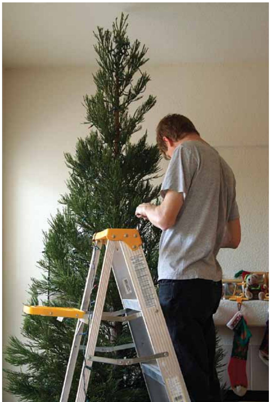
When purchasing a live tree, check for freshness. A fresh tree is green, needles are hard to pull from branches and when bent between your fingers, needles do not break.

When setting up a tree at home, remember to place it away from fireplaces and radiators. Be-